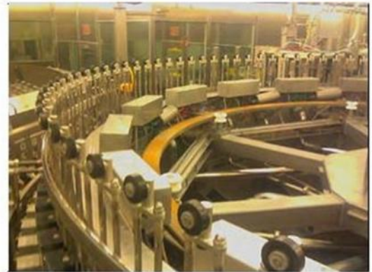
Processing Rooms / Filing Lines