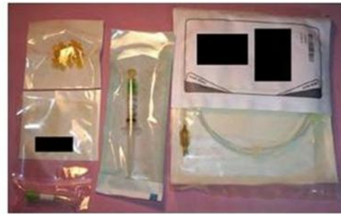
Products and Components