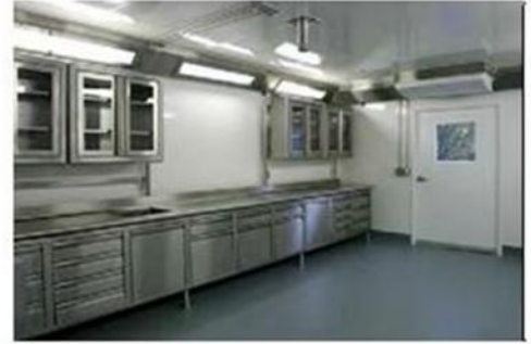
BSL 1-4 Laboratories/Suites