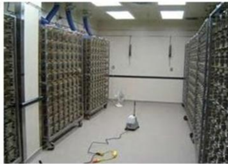
Animal Holding Rooms