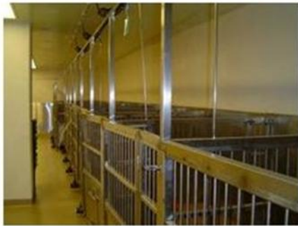
Large Animal Holding Rooms