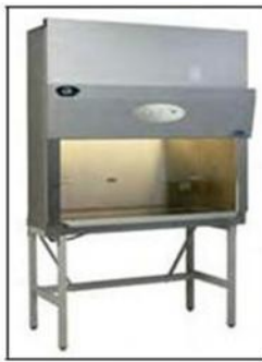
Biological Safety Cabinets